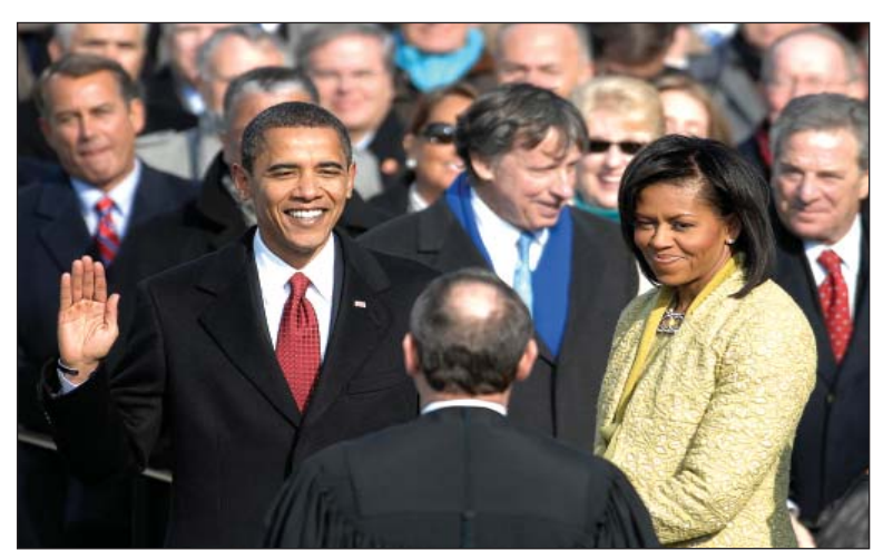
Barack Obama taking the Oath of Office.

ince his election and inauguration, it has been clear that Barack Obama, represents many things to many people, not only in the U.S., but worldwide as well. I experienced his global appeal when I was in Kuala Lumpur, Malaysia, and a Muslim Tamil Indian, who considers himself a member of